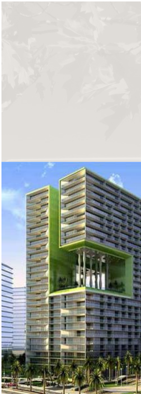
The Cube is a unique and innovative landmark tower that will occupy a prime location within Dubai Sports City. Parking condos are available in the basement level.

be”. The combination of integrated parking (all of our parking is in convenient, mixed-use facilities with activated street-level uses) and a concentrated effort on “place making” and public realm improvements.