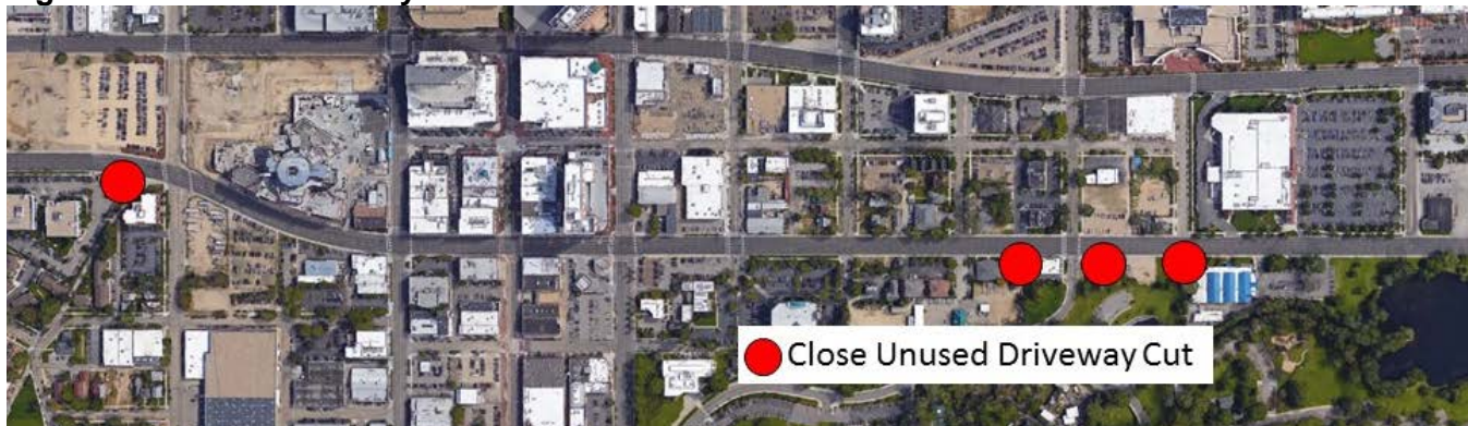
Figure 4: Unused Driveway Cuts to be Removed

ITD has agreed to close the four unused driveway cuts depicted in Figure 4 as part of its resurfacing project, subject to this cooperative agreement. One driveway abuts property owned by CCDC (adjacent to the Pioneer Pathway), two driveways abut property owned by the City of Boise adjacent to Julia Davis Park, and the fourth driveway abuts two privately owned parcels.