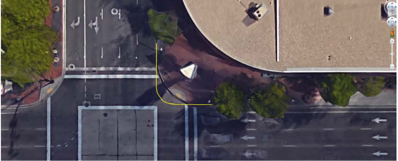
Figure 1: Illustration of Curb Radius Reduction at the Northeast Corner of Front and 9th

Additionally, where vehicle turning movements occur, they can reduce vehicle turning speeds. ITD has agreed to reduce the radii of the 20 corners shown in Figure 2 could be reduced to 10 or 15 feet with its resurfacing project, subject to this cooperative agreement.