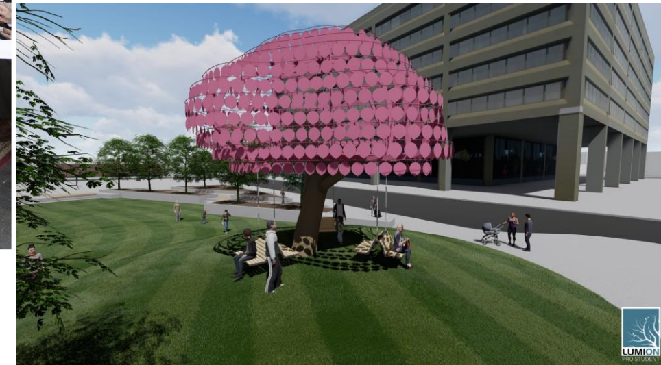
Two Artwork Concepts