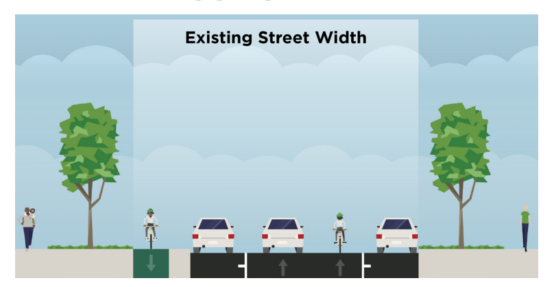
2nd Choice of 8th Street Property Owners